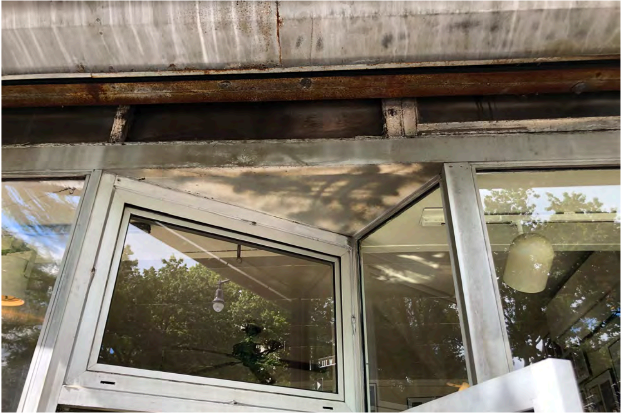
Photo of current state: facade is made of aluminum parts, wood frames and acrylic filling.