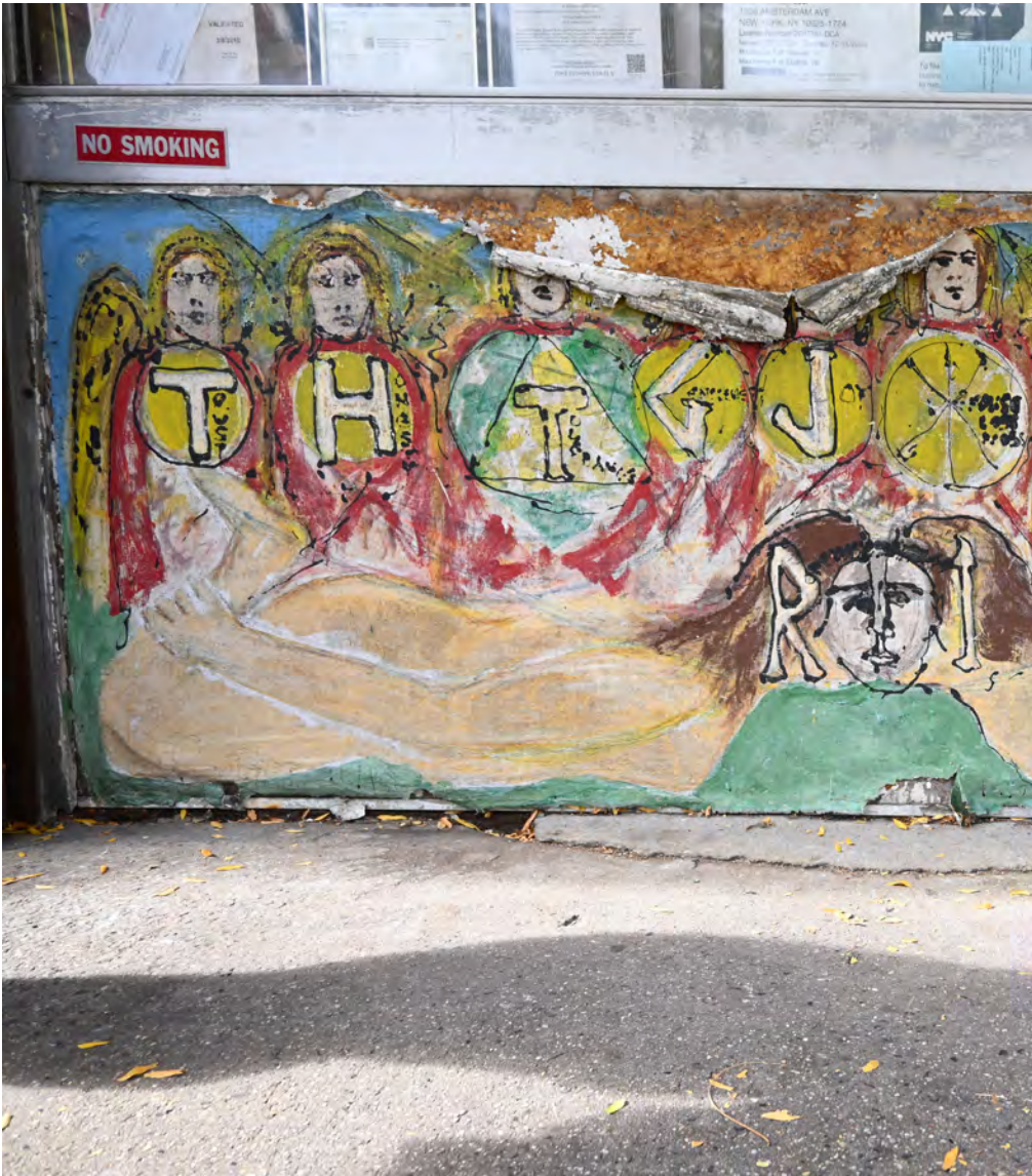
Photo of current state: original painting on vinyl is pilling off.

In addition, neither door meets ADA clearance and approach requirements.