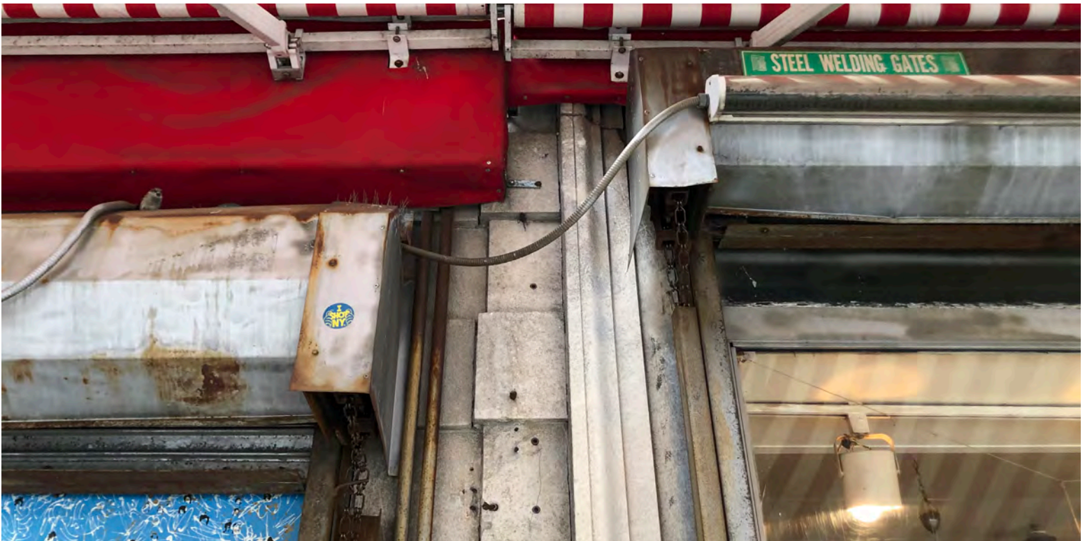
Photo of current state: outside lighting was an afterthought and electric installation is precarious.